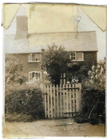
20th century exterior renovations

We have some details of owners from the 19 th century census returns and later details were gleaned from documents that the Catchpole family kindly donated to the Stowupland archives.