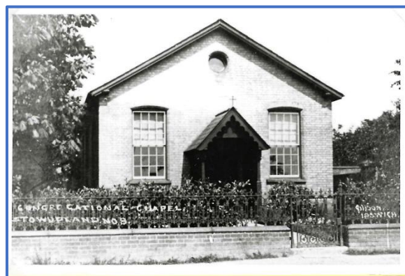
URC as it appeared at the end of the 20 th century.